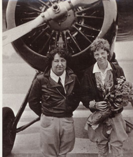
Pancho Barnes and Amelia Earhart. Story on page 17.