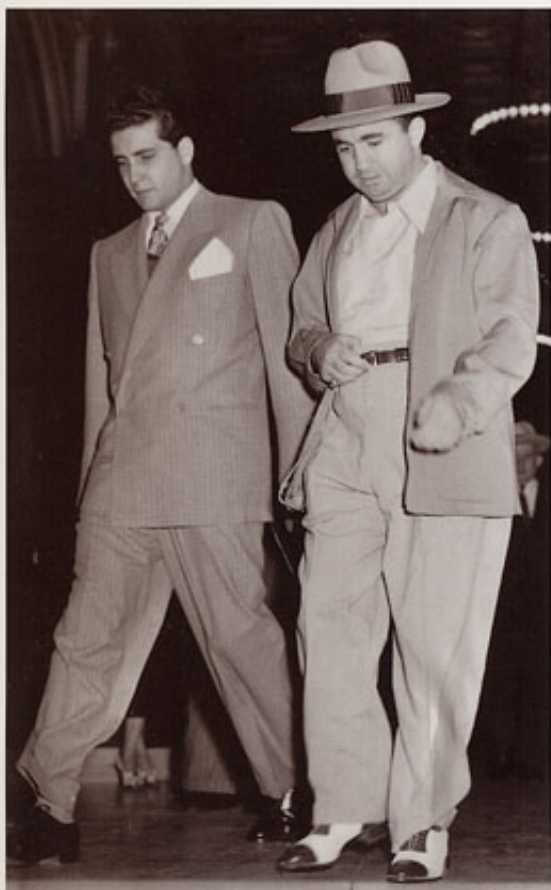
Johnny Stompanato, left, and Mickey Cohen. Story on page 48.